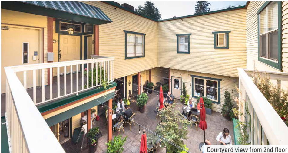
Courtyard view from 2nd floor