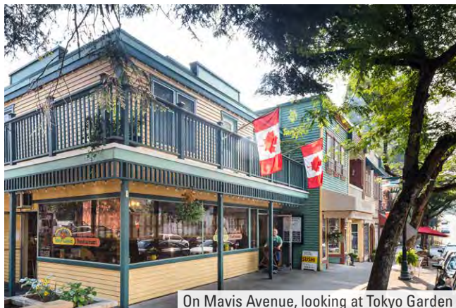
On Mavis Avenue, looking at Tokyo Garden