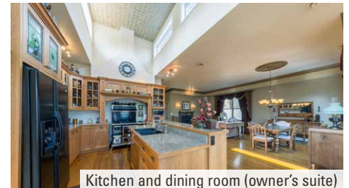
Kitchen and dining room (owner's suite)