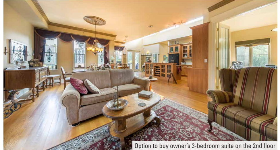
Option to buy owner's 3-bedroom suite on the 2nd floor